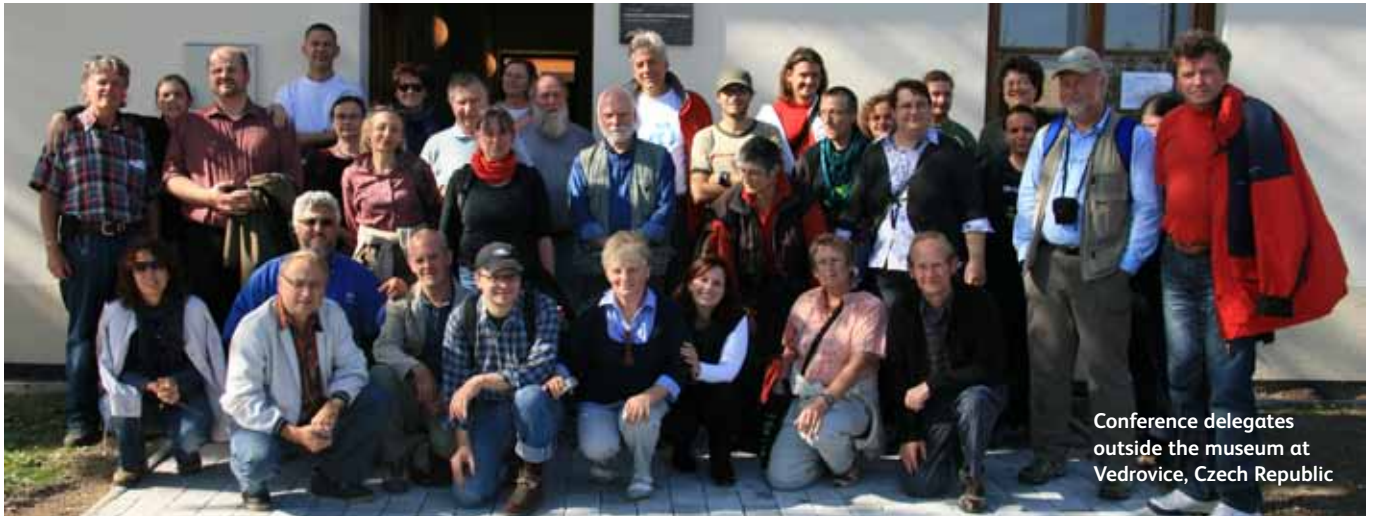
Conference delegates outside the museum at Vedrovice, Czech Republic

At the end of September I attended a conference on flint mining at the Institut für Ur- und Frühgeschichte, University of Vienna. This was the Third International Conference of the Commission on Flint Mining in Pre- and Proto-historic Times, of which I am a committee member. The Commission was established in 2006 as a scientific working-party of the UISPP (Union internationale des Sciences Préhistoriques et Protohistoriques).